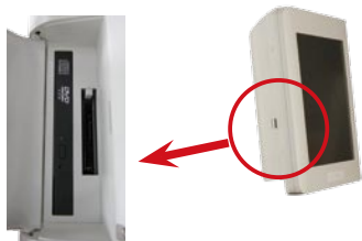
Optical Drive and Express Card Slot

The POC-3174A has a optical drive at the side of the panel, allowing real-time image burning purpose. The built-in optical drive makes POC-3174A a perfect image processing terminal.